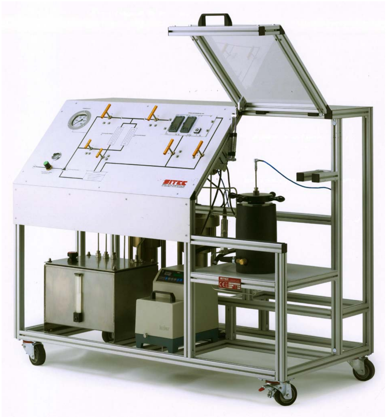
Picture 1: High Pressure Sterilisation Unit (7,000 bar, 80 °C, 100 ml sterilisation cell with 70 ml basket insert).